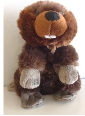
Bach reminds us to be CREATIVE