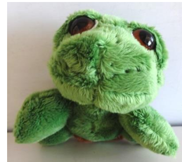
Sherman reminds us to be INDEPENDENT