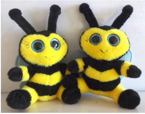
Honey and Pollen help us to be COOPERATIVE