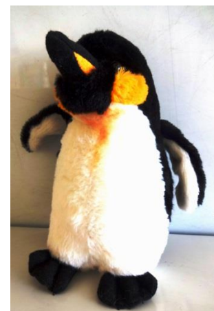
Iceberg reminds us to be RESILIENT