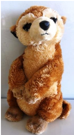
Peek reminds us to be CURIOUS